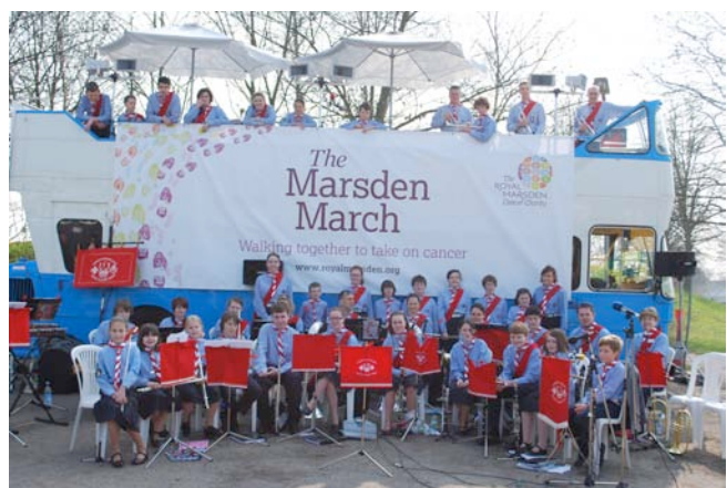
Providing entertainment during the "Marsden March" Charity Walk, March 2011